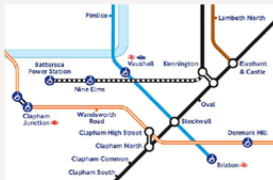
Tube map of proposed extension

Battersea Power Station is a new London Underground Station, due for completion in September 2021 as part of the ongoing Northern Line Extension. Once complete, the new station will place residents just a few minutes' walk from the tube network and its connections to the Capital and beyond.