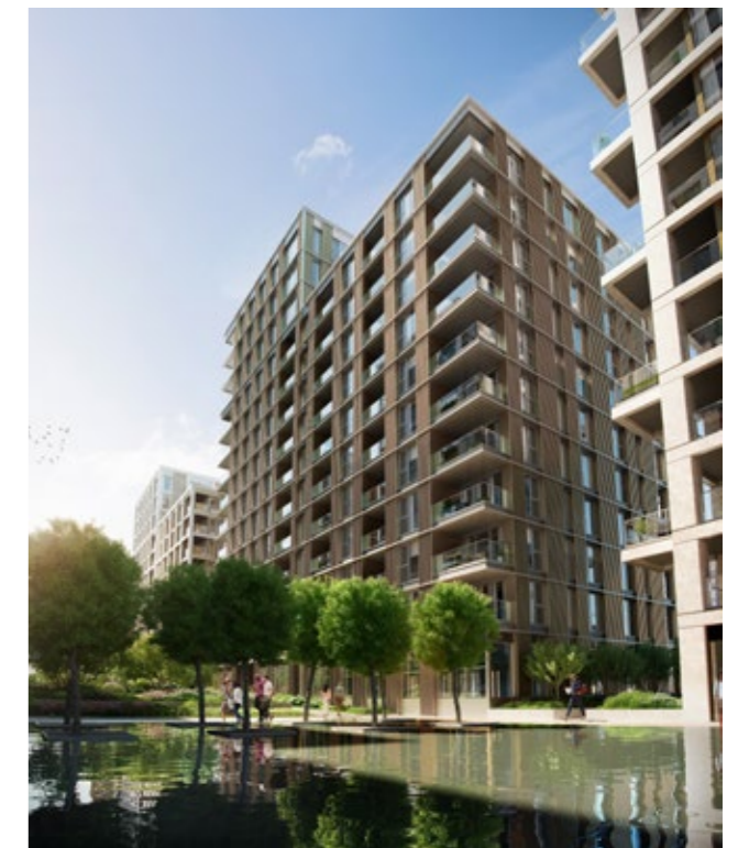
This View Looking south west across the pond to Bowden House (foreground) and Radley House.